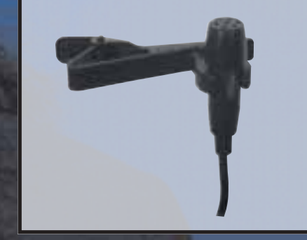
CK 55 L (actual size)